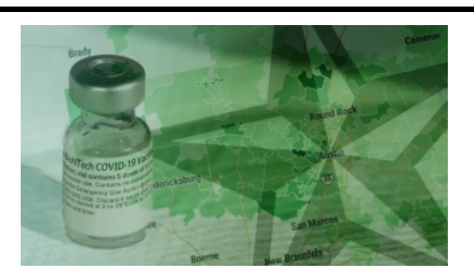
MAPS: How many people are fully vaccinated against COVID-19 in your zip code?